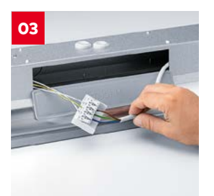
Connect the cable to a 5-way terminal block