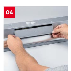
Close the hatch