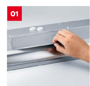
Open the hatch on the side