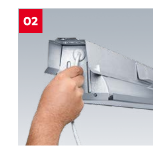
Bring the cable through the cable entries on the side or top of the housing